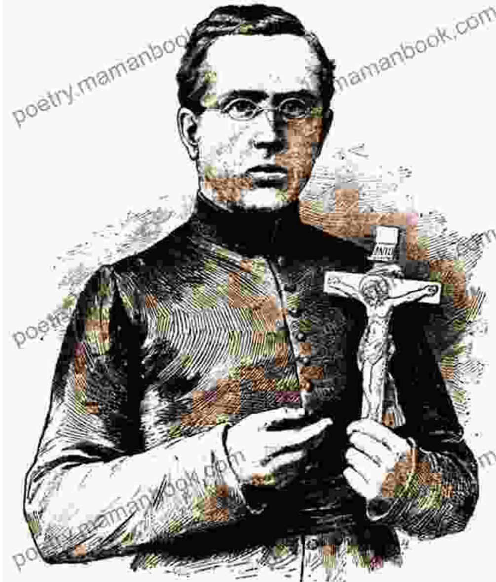
The Late Father Damien.