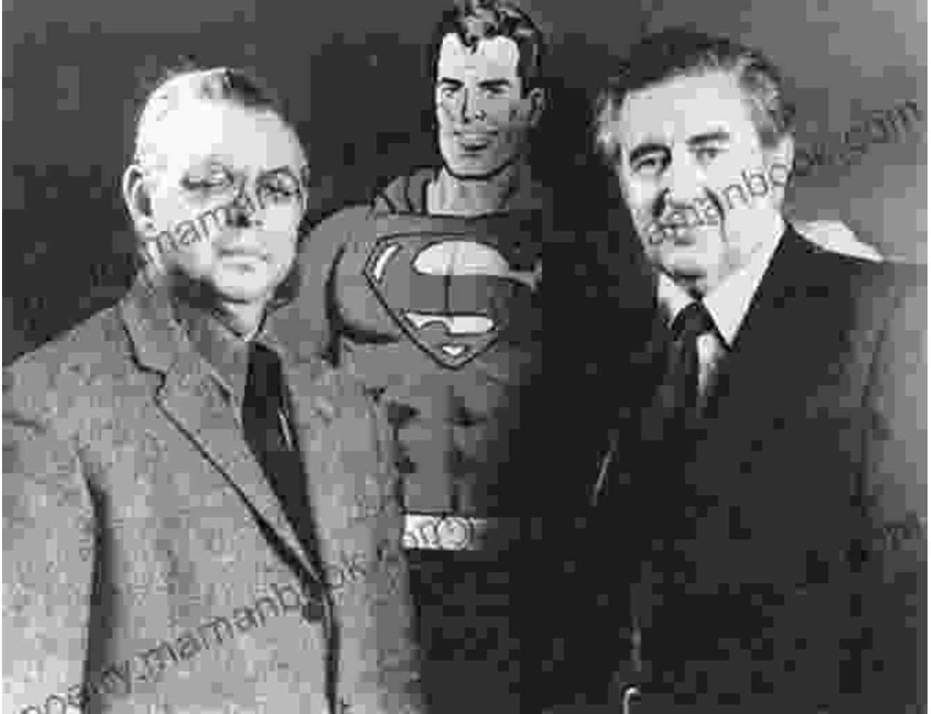
Jerry Siegel, Joe Shuster, John Byrne, Curt Swan, Dan Jurgens: The Legendary Creative Teams of Action Comics

storytelling prowess to the pages of Action Comics. Their contributions have shaped the character of Superman, expanded the scope of his adventures, and cemented the series' place in comic book history.